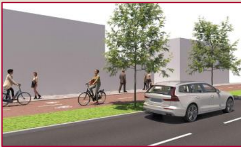
Standard Cycle Track (One-way and Two-way)