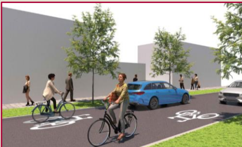
Mixed Traffic Facilities (where feasible)