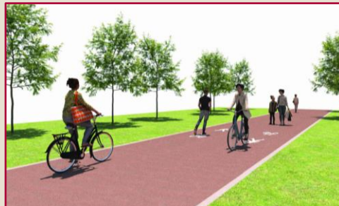
Shared Active Travel Facilities