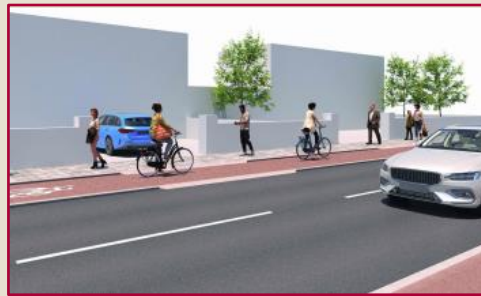
Stepped Cycle Track (One-way only) either side of the road